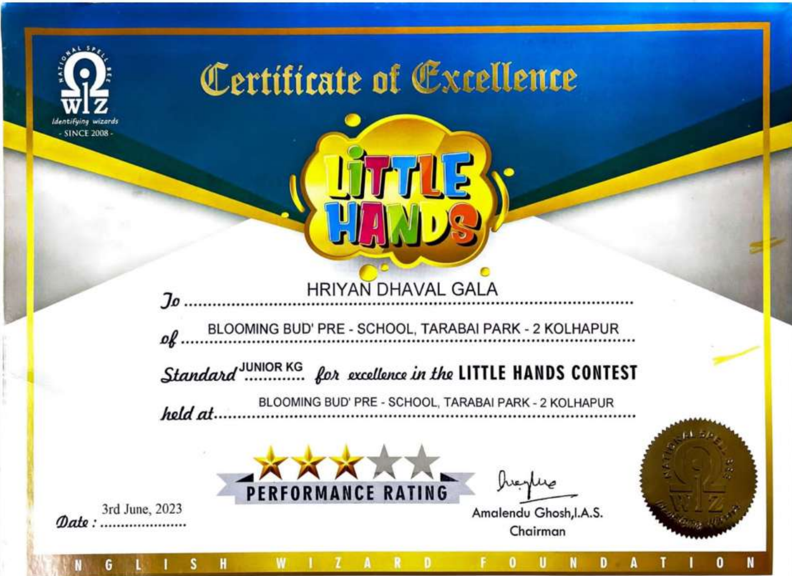
ROTAKID RIYAN DHAVAL GALA GOT CERTIFICATE OF EXCELLENCE FOR LITTLE HANDS CONTEST