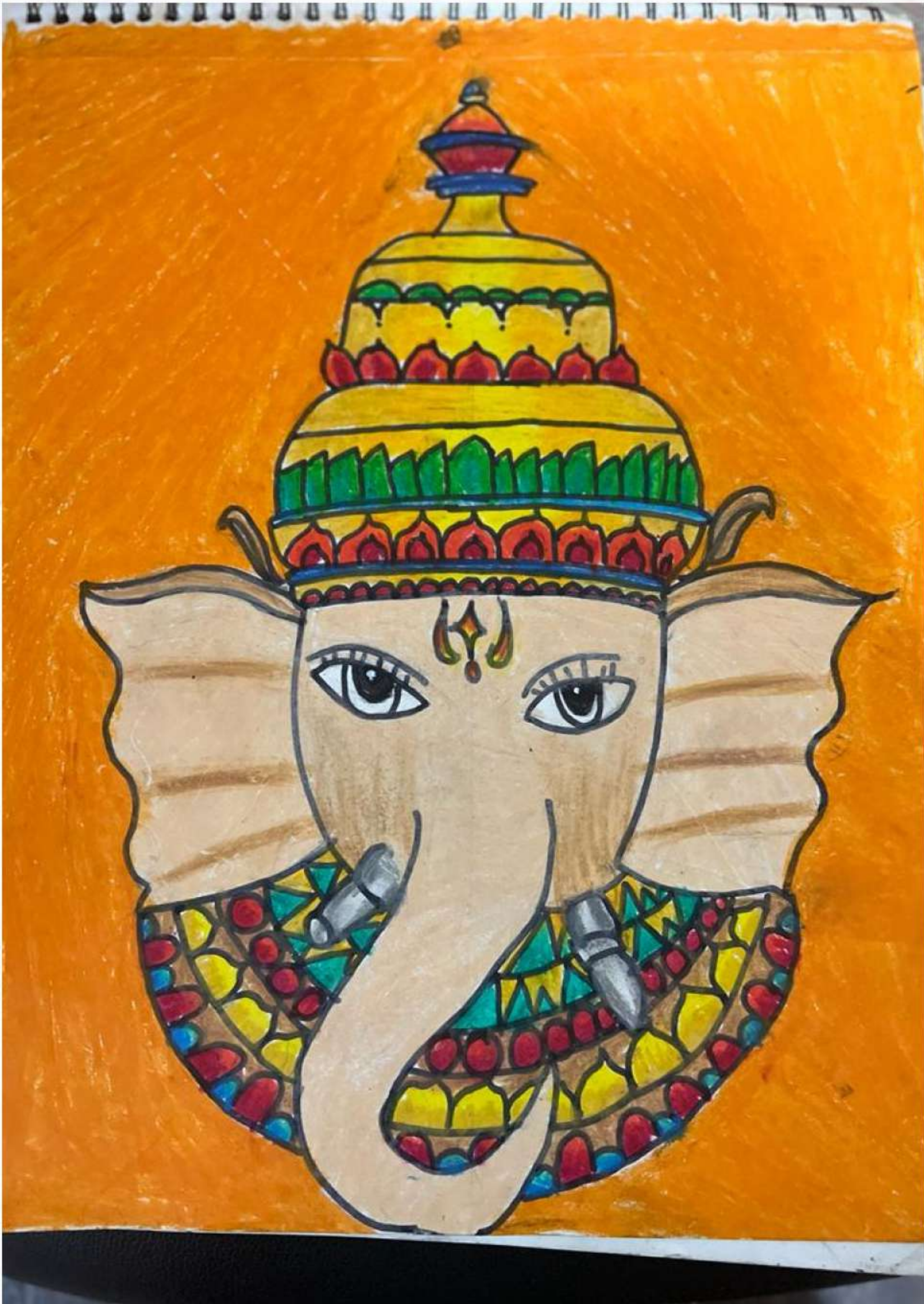
DRAWING BY ROTAKID NIHARIKA DEEPAK CHARANE